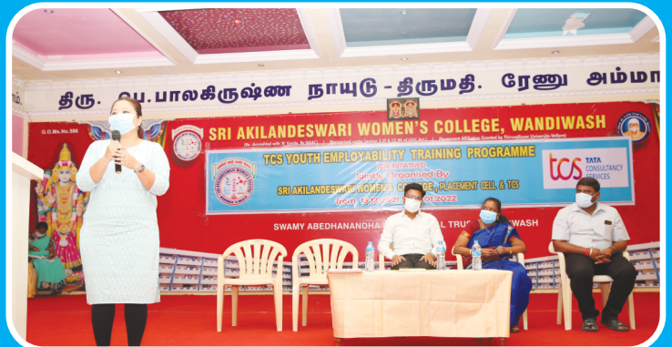
Youth Employability Campus Training Programme (20 Days) Conducted by TCS . 250 students were participated. 108 Students Cleared the NQT Exam & Waiting for Interview.