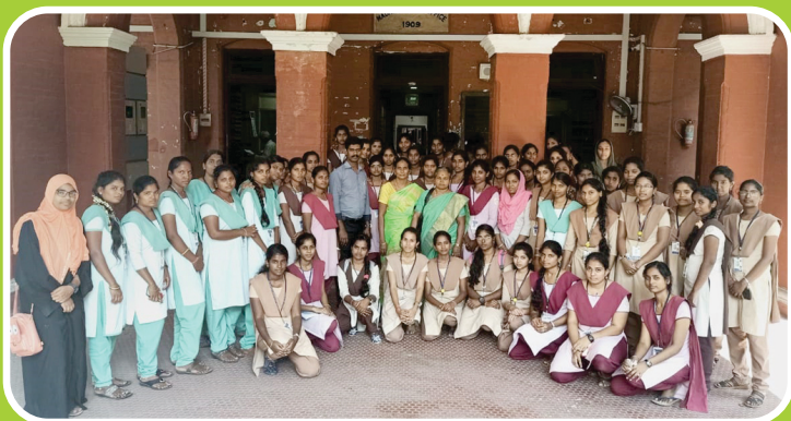
Students' Visit to Tamil Nadu Avanakappakam (Archives) and Connemara Public Library – Chennai