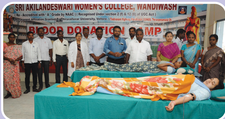
Blood Donation Camp jointly organised by Government Medical College - Chengalpattu .