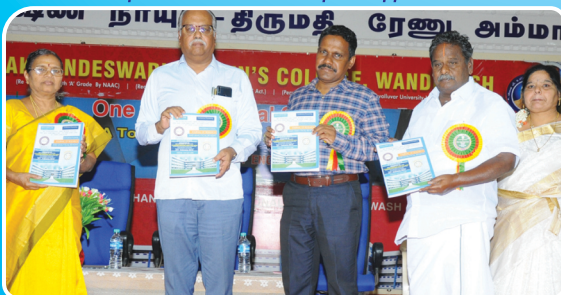
National Level Conference on Media : A Tool for Social and Cultural Development organised by Department of English.