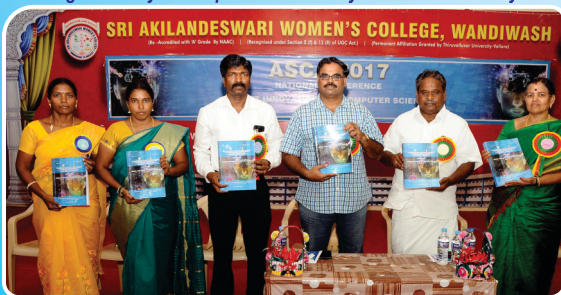
National Level Conference on Recent Innovations in Computer Science. Organised by the Departments of Computer Science and Computer Applications.