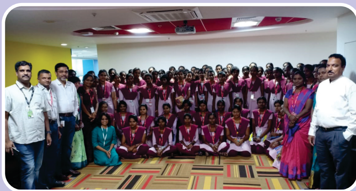
Industrial Visit – IBM, Bangalore.