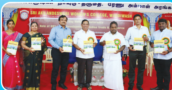
National Level Conference on Role of GST in the Development of Indian Trade and Commerce organised by Department of Commerce.