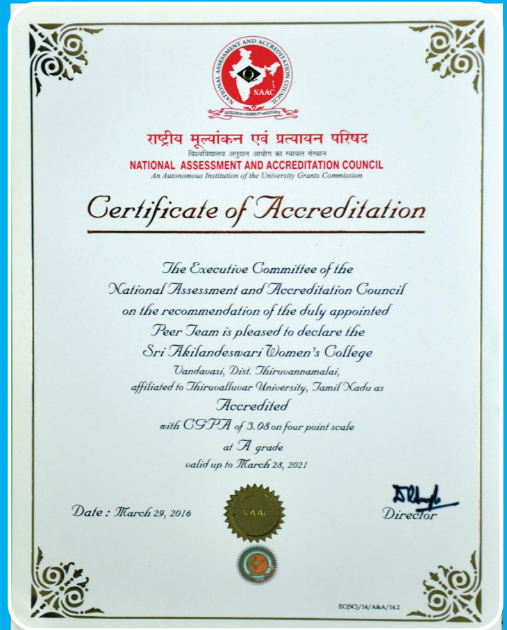
Re-Accredited with 'A' Grade by NAAC