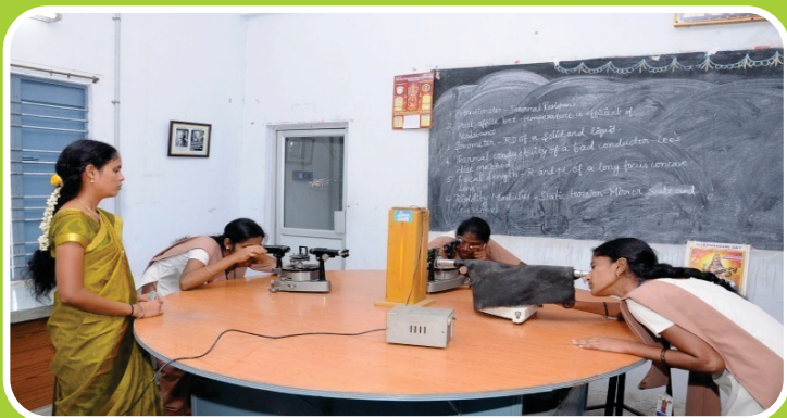
Students doing their Experiments in Physics Lab