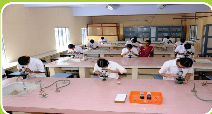
Experiment done by Students in Microbiology Lab