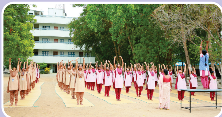
Celebration of International Yoga Day – 2020.