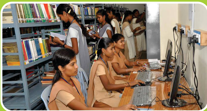
Students referring E-resources in Library