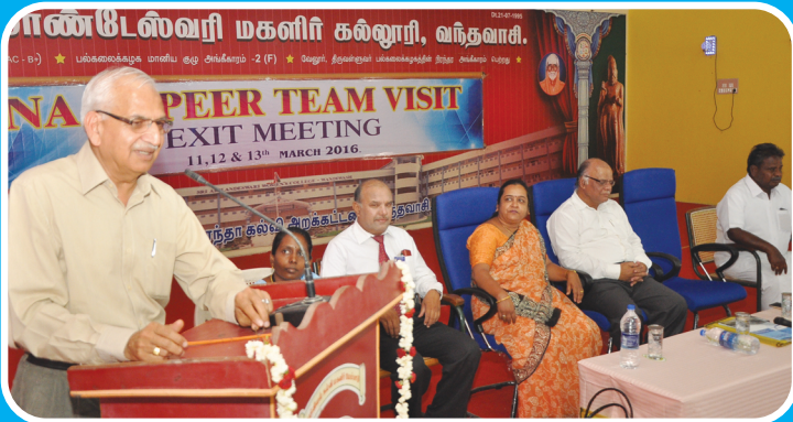
NAAC – Exit Meeting – 2016