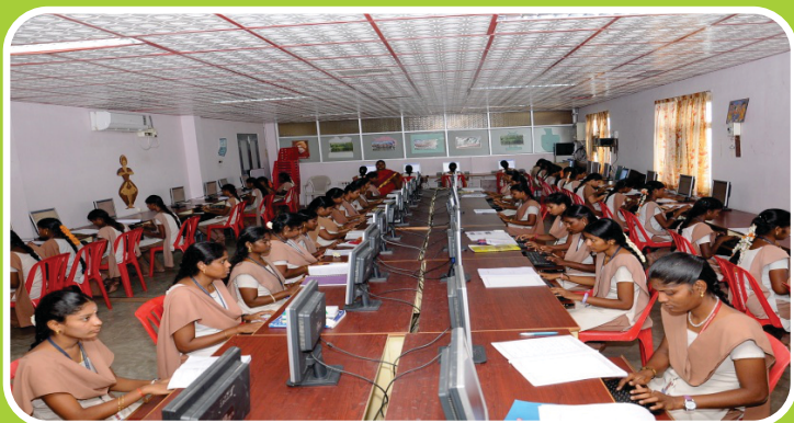
Students Operating Computers in Computer Lab