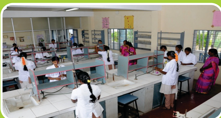
Students doing their practical in Chemistry Lab