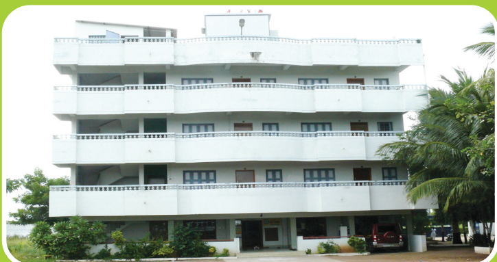
Administration & Hostel Block