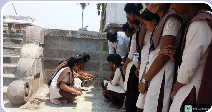
One week Internship on Inscription Training Conducted by "Yavarum Keeler" Organisation