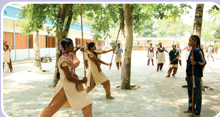
Practicing the Indian Martial Art of "SILAMBAM"