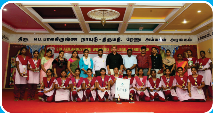
One week Soft skill & Aptitude Training programme Conducted by TITAN LEAP – Chennai .