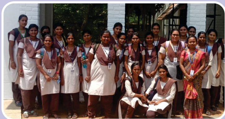
Educational Visit to Dakshina Chitra – Muttukad, Chennai. by English Department.