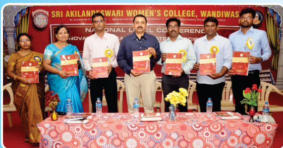
National Level Conference on Innovative Research in Material Science. Organised by the Departments of Physics and Chemistry.