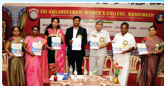
National Level Conference on Bio Resources of Marine Environment. Organised by the Departments of Biochemistry and Microbiology.