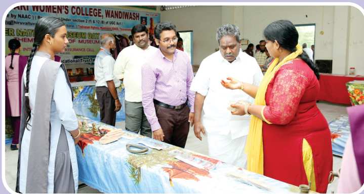
International Museum Day – 2022 Organised by IQAC.