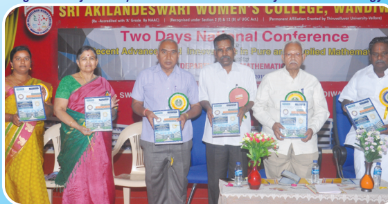
National Level Conference on Recent Advances and Innovations in Pure and Applied Mathematics. Organised by Department of Mathematics.