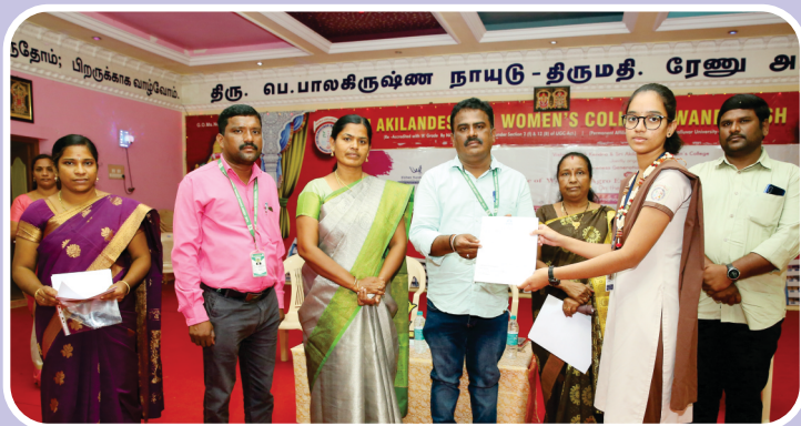
Awareness Generation Programme on "Role of Women in Agro Entrepreneurship Development" organised by Vishwa Yuvak Kendra.