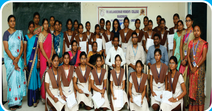
Mega Campus Placement Drive – 2022 organized by Placement & Career Guidance Cell and OSA.