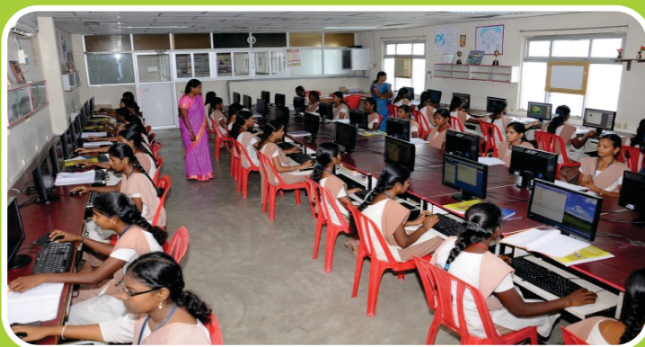
BCA Students doing their Projects in Computer Lab