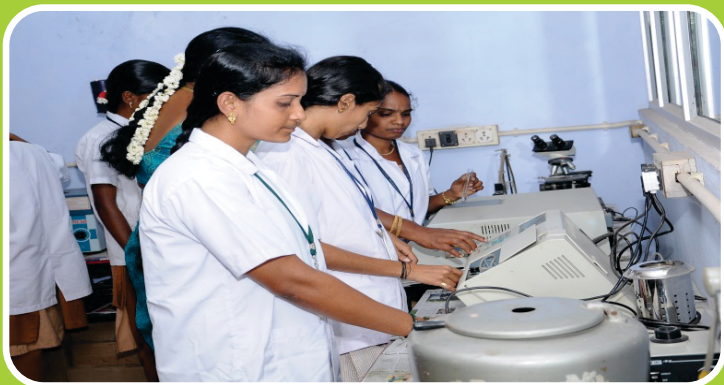
Students doing practicals in Biochemistry Lab.