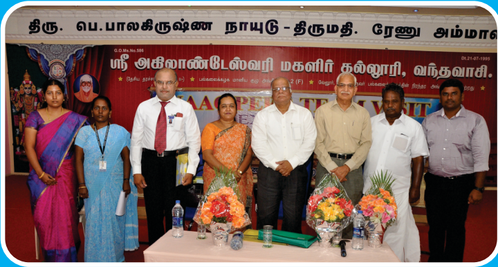
Our College being awarded with "A" Grade by NAAC PEER TEAM During Re- Accreditation.